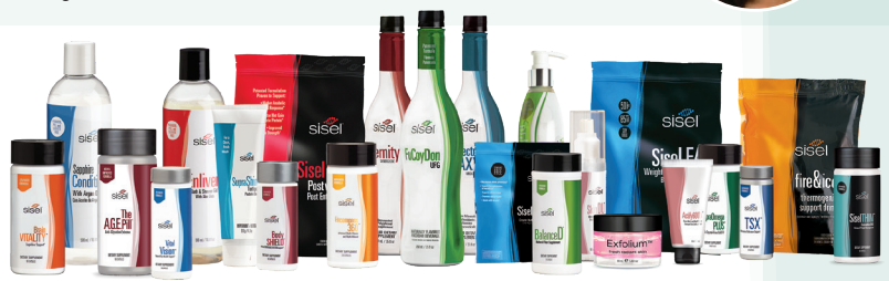
All our US packaging and labels include Spanish translations.